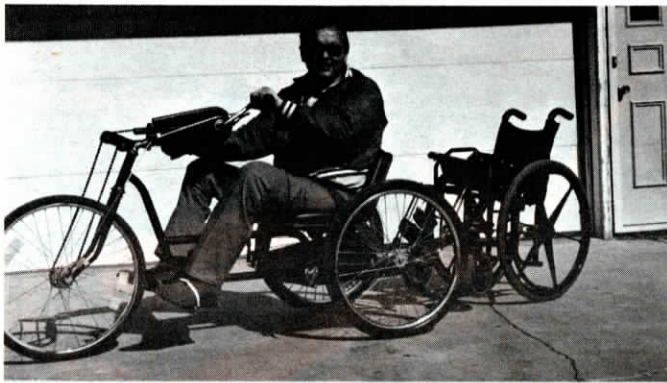
Handlebars act as "pedal" to power front wheel.