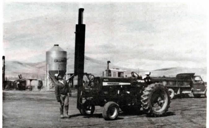
Post driver tilts in any direction and can be shifted sideways.

For more information, contact: FARM SHOW Followup, Michael Bauer, Rt. 1, Box 53, Freeburg, Mo. 65035 (ph 314/744-5833).