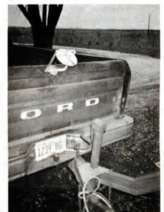
One advantage of this magnetic mirror is that you only bring it out when you need it.

If you've removed the tailgate, or have a tire mounted at the middle of the gate, you can mount the mirror to the left rear quarter panel. At night, you can position a flashlight with a magnetic base on the tailgate so that it shines onto the mirror. The mirror can also be used to hook up a gooseneck trailer on pickups with a toolbox behind the cab obstructing visibility of the ball hitch or