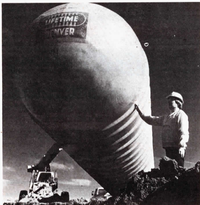
Because fiberglass tanks don't rust or corrode, you can store fuel in them indefinitely without deterioration, says manufacturer.

For more information, contact: FARM SHOW Followup, Fiberglass Unlimited, Box 1297, Watertown, S. Dak. 57201 (ph 605 886-5137).