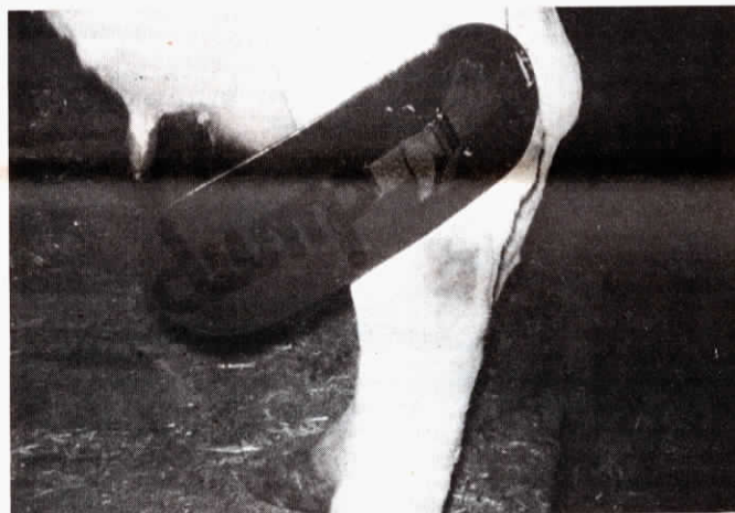
Turn this picture upside down and "dump" still reads "dump".